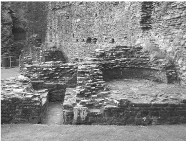
Figure 6 Oven and malt brewery. White Castle, Monmouthshire

The 'failure of the beer' – meaning the malt harvest – was from time to time recorded lugubriously by the Dunstable chronicler. In 1262 and 1274, wine had to be bought in to replace the beer that was not available, which the chronicler seems to have regarded as a less pleasing alternative. This may mean that English tastes were already favouring beer over wine. In Mediterranean regions, however, beer was regarded as something of an aberration. A health handbook written for the countess of Provence in 1256 by Aldobrandino of Siena advised that beer was bad for the head and the stomach, it gave the drinker bad breath, and filled the